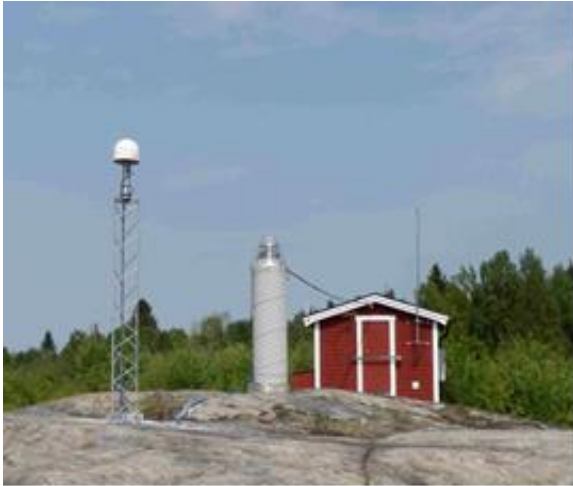
Figure 4.1: Hässleholm is one of the SWEPOS stations belonging to class A. It has both a new monument (established in 2011) and an old monument (from 1993).