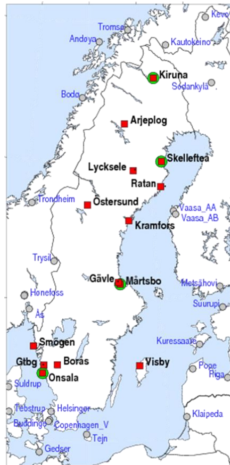
Figure 10.1: The 14 absolute gravity sites (for FG5) in Sweden (red squares) and sites in neighbouring countries (grey circles). The four sites with time series more than 15 years long have a green circle as background to the red square.

absolute gravimeter A-10 - 020 for the observations. 97 sites have been measured in co-operation with IGIK until 2015. Some relative measurements and some calculations concerning the land uplift for the FG5 sites remain until it is time to define the system (Engfeldt 2016b).