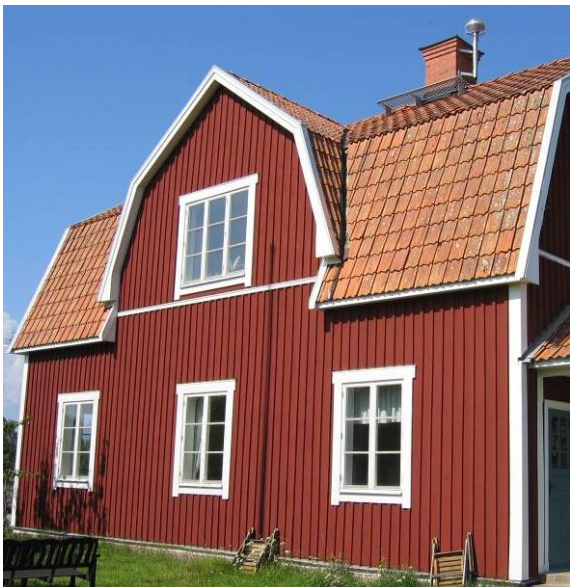
Figure 4.2: Söderboda is a SWEPOS station with a roof-mounted GNSS antenna mainly established for network RTK purposes belonging to class B.

The class A stations are built on bedrock and have redundant equipment for GNSS observations, communications, power supply, etc. They have also been connected by precise levelling to the national precise levelling network. Class B stations are mainly established on top of buildings for network RTK purposes. They have the same instrumentation as class A stations (dual-frequency multi-GNSS receivers with antennas of Dorne Margolin choke ring design), but with somewhat less redundancy.