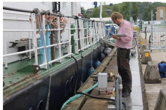
Figure 9.1: Harbour tie gravity measurement made by Lantmäteriet in the FAMOS project.

Lantmäteriet is also engaged in the EU project FAMOS 18 . The main purpose of FAMOS is to increase the safety of navigation in the Baltic Sea, mainly by finalising hydrographic surveying in those areas that are of interest for commercial shipping. Another aim is to improve navigation and hydrographic surveying with GNSS based methods in the future. In activity 2 ( Harmonising vertical datum ) of the project, the main goal is to improve the geoid in the Baltic Sea area, which will provide an important basis for future offshore navigation. To reach the goal of an improved Baltic Sea geoid model, new marine gravity data are collected from the hydrographic surveying vessels, both to check and improve the existing data as well as to fill in empty areas. According to the plan, a new validated FAMOS geoid model will be released by 2020. The first part of the project (FAMOS Freja) lasts from 2014 to 2016.