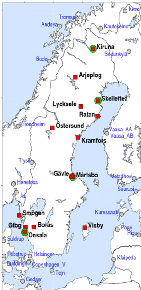
Figure 10.1: The 14 absolute gravity sites (for FG5) in Sweden (red squares) and sites in neighbouring countries (grey circles). The four sites with time series more than 15 years long have a green circle as background to the red square.

Republic of Macedonia and in Bosnia and Herzegovina. Furthermore, seven inter-comparisons have been carried out; in Luxembourg, Paris and Wettzell.