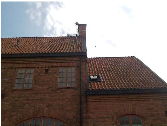
Figure 4.2: Vagnhärads is a SWEPOS station with a roof-mounted GNSS antenna mainly established for network RTK purposes belonging to class B.

(dual-frequency multi-GNSS receivers with antennas of Dorne Margolin choke ring design), but with somewhat less redundancy.