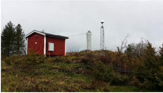
Figure 4.1: Sveg is one of the SWEPOS stations belonging to class A. It has both a new monument (established in 2011) and an old monument (from 1993).