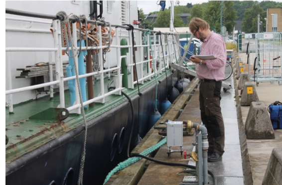
Figure 9.1: Harbour tie gravity measurement made by Lantmäteriet in the FAMOS project.

vered in April 2017. We further work with connecting the Swedish tide gauges to RH 2000 as well as with evaluating different real-time GNSS navigation methods at sea.